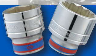
Standard = Blue Imperial = Red