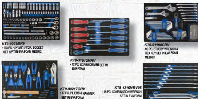
KT9-9003MRV • 103 PC. 1/2" 3/8" 1/4" DR. SOCKET SET 12PT IN EVA FOAM METRIC