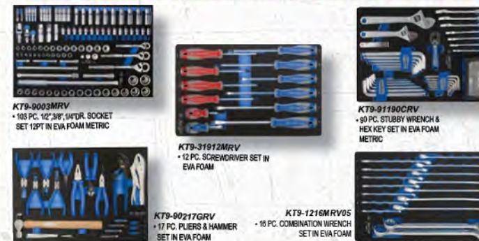
KT9-9003MRV • 103 PC. 1/2" 3/8" 1/4" DR. SOCKET SET 12PT IN EVA FOAM METRIC