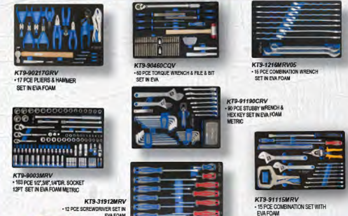
KT9-9003MRV • 103 PC. 1/2" 3/8" 1/4" DR. SOCKET SET IN EVA FOAM